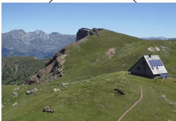
Refugio de Arlet