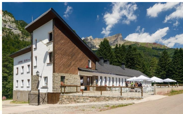
Refugio Selva de Oza