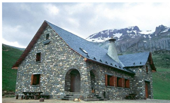
Refugio de Lizara