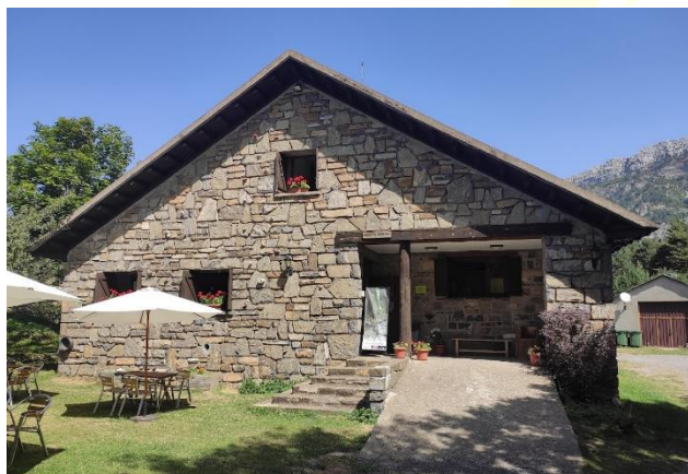
Refugio de Gabarito